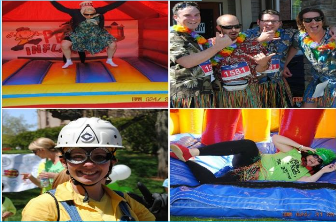
Participants & volunteers enjoy the 2014 Capital One Race for Kids!