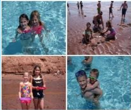
Children from Charlottetown's 2014 Summer Camp enjoy outings to the beach & pool!

We can't wait to spend the summer with you!